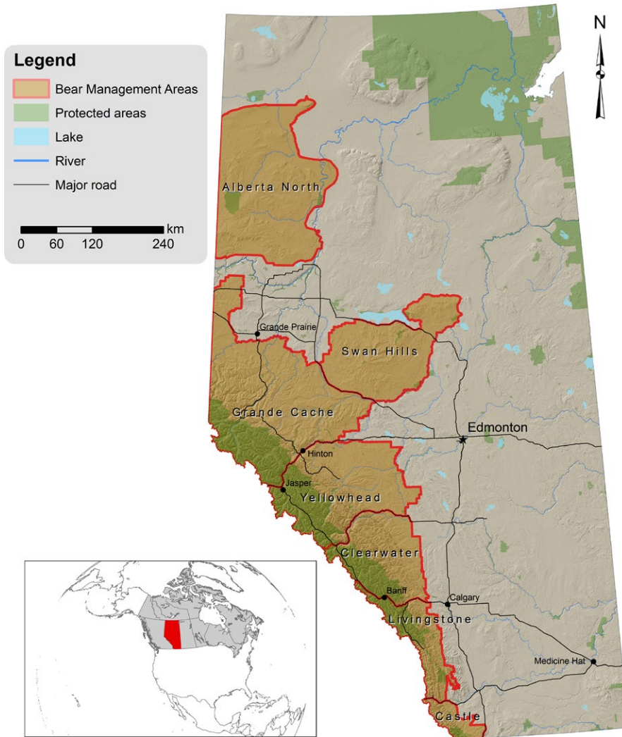
FIGURE 1 Grizzly bear management areas (BMAs) in the province of Alberta, Canada

the importance of critically evaluating scientific research, that it was not necessary to disprove or distrust the science supporting a sustainable harvest of grizzly bears in BC for the hunt to be called off, as it was a political decision. No matter that the loss of a certain number of grizzly bears might be sustainable from a population perspective, society has deemed it unacceptable to lose any grizzlies to trophy hunting. The science simply said that a hunt could happen sustainably, not that it should happen.